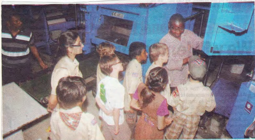
Pupils of American International School, Lagos being conducted round the press hall of National Mirror newspapers during their visit to the corporate headquarters of the company, yesterday.

Our Scouts visited the Corporate Headquarters of the National Mirror (Newspaper). They enjoyed learning about how a newspaper is printed and they even got interviewed! The following picture was published in the paper.