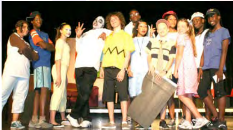
Happy Holidays from the cast of Your A Good Man Charlie Brown

There will be no Friday Newsletter next week! Early dismissal on Friday, December 14th at 11:00 a.m. The school campus will be closed for the Winter Holidays. School Resumes January 7th, 2008 at 7:30 a.m. sharp!