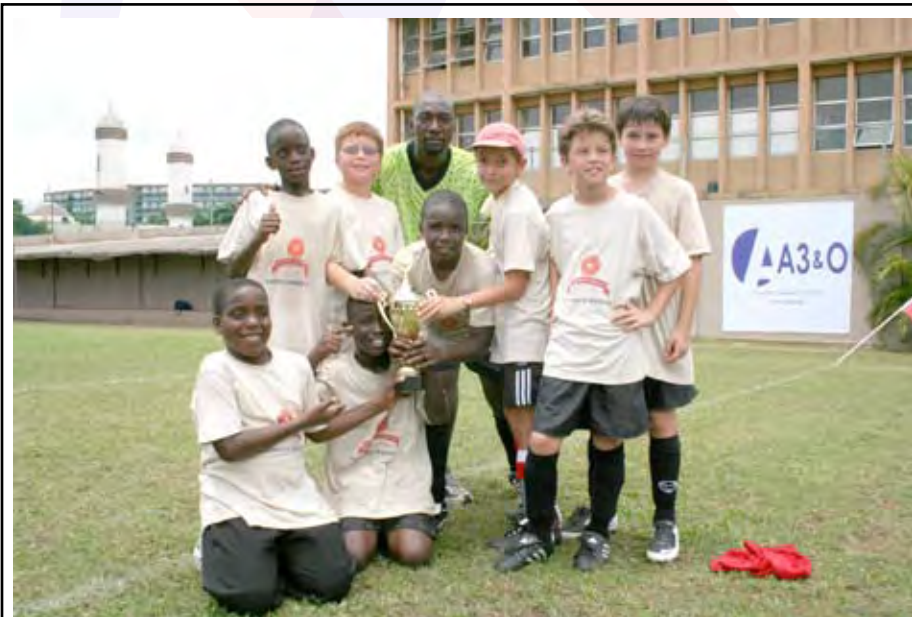
Division 2 Goodwill Games Champions

Check www.aislagos.org for additional details